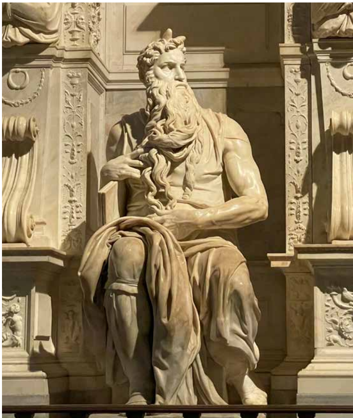
Michelangelo's Moses at St. Peter in Chains Basilica.