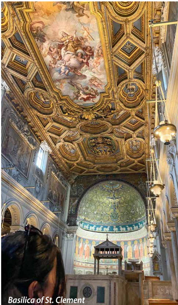
Basilica of St. Clement