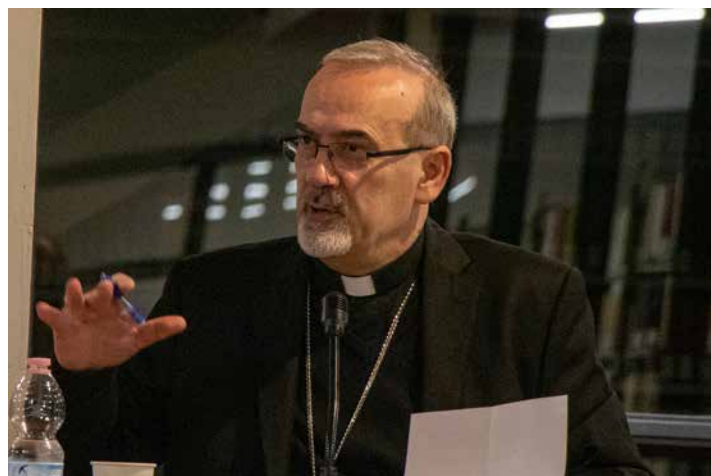
Archbishop Pierbattista Pizzaballa, Latin Patriarch of Jerusalem, discusses “Fratelli Tutti”.

A native of Cologno al Serio (Bergamo), Italy, the Patriarch was ordained a priest in the Order of Friars Minor (OFM) on September 15, 1990. The following month he was sent to the Holy Land and subsequently entered the service of the Custody of the Holy Land. He obtained a Licentiate in Biblical Theology at the Studium Biblicum Franciscanum in Jerusalem.