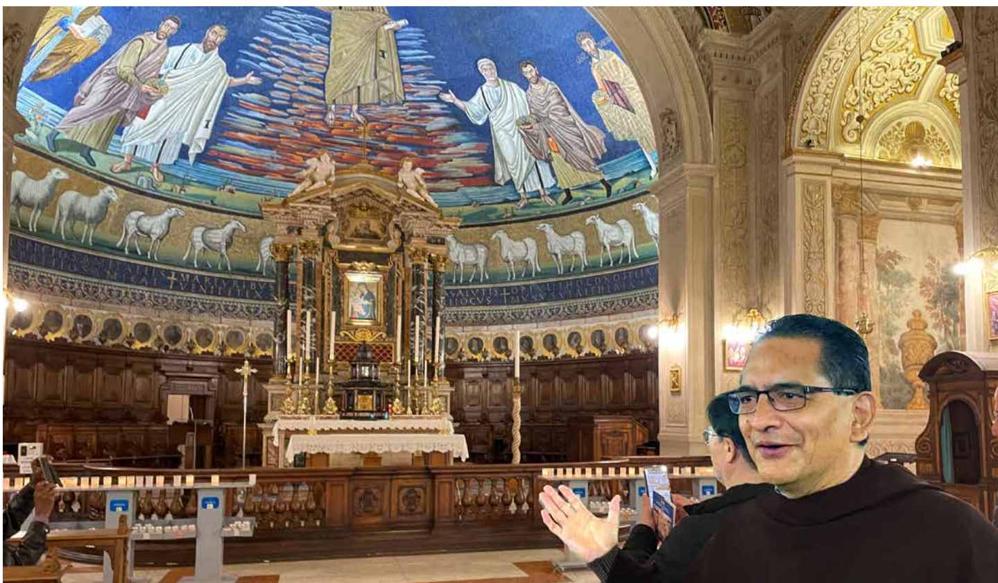
TOR Minister General Amando Trujillo Cano gives tour of Saints Cosmas and Damian Basilica.