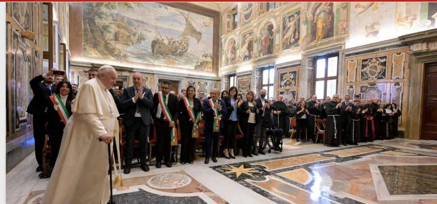
Pope Francis greets members of the Franciscan Family during a private audience Oct. 31.