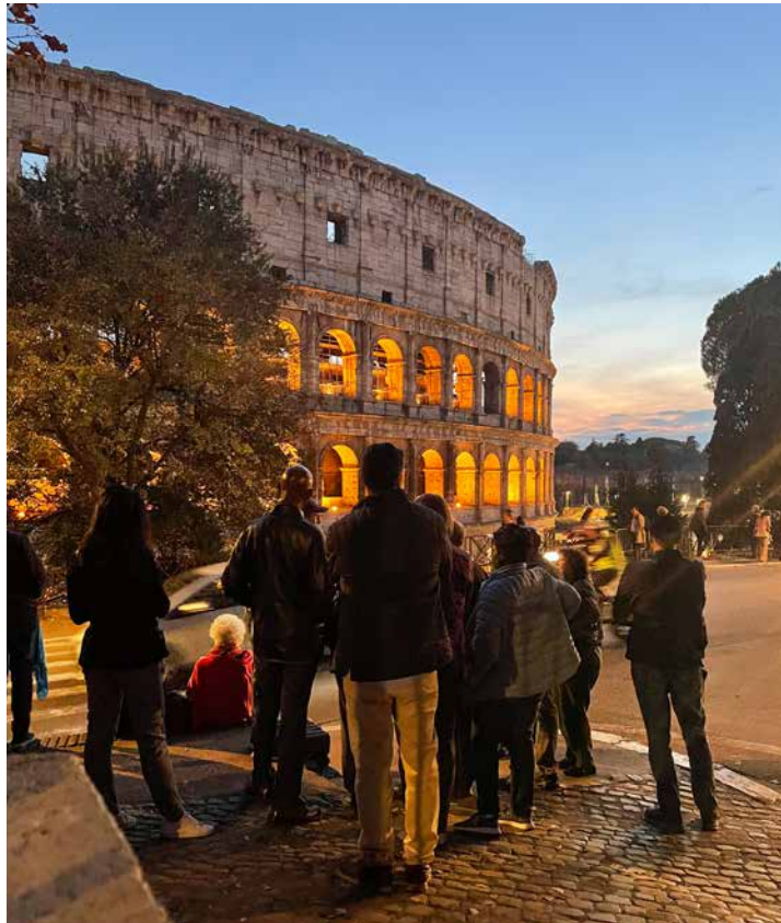
Members gather around tour guide at the Colosseum.