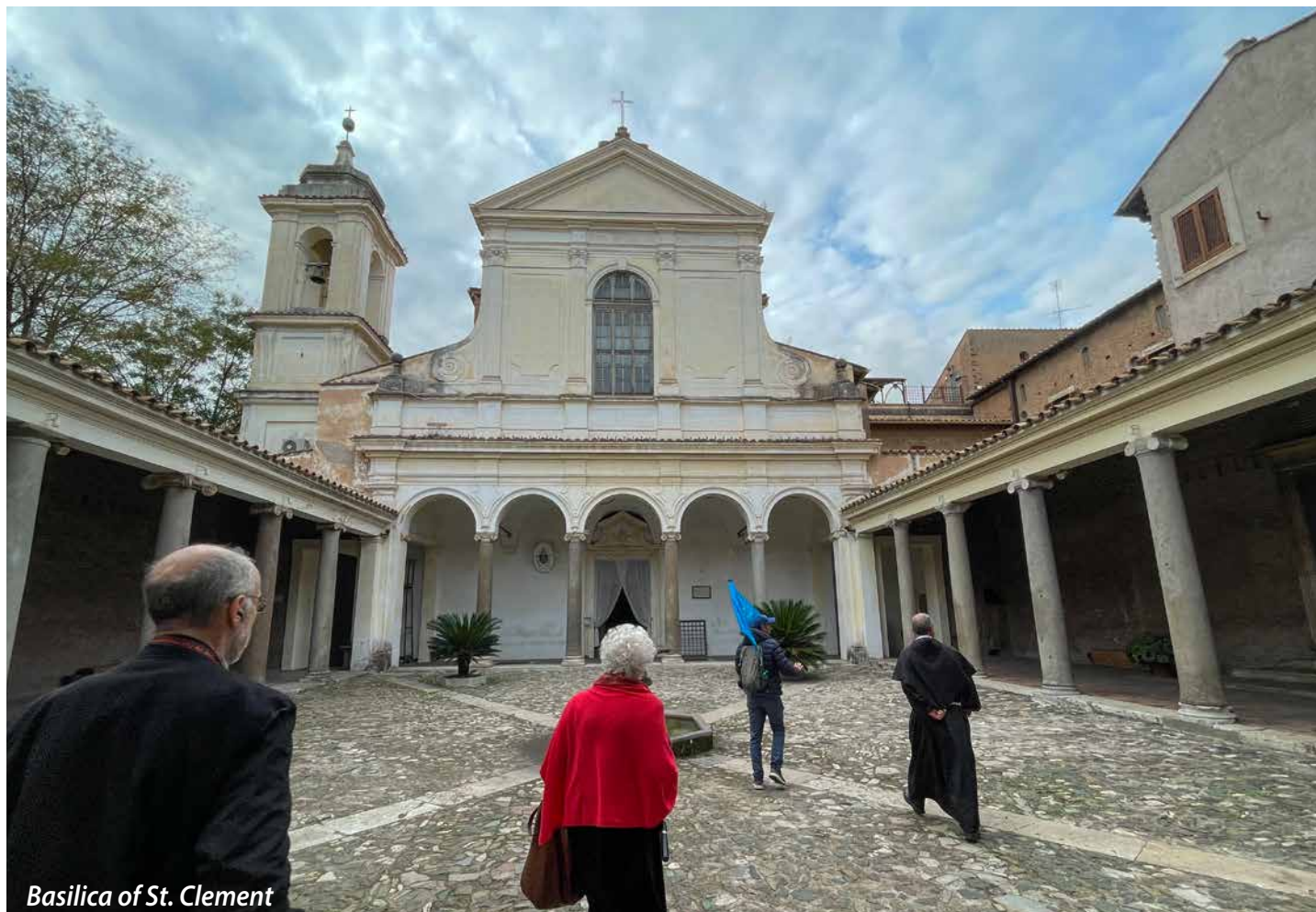
Basilica of St. Clement