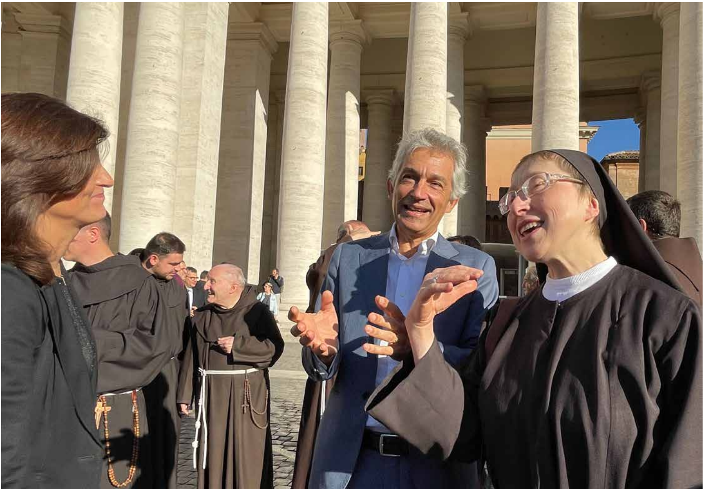
Friars, seculars and Poor Clares gathered in St. Peter's Square, expressing joy at being part of the same family.