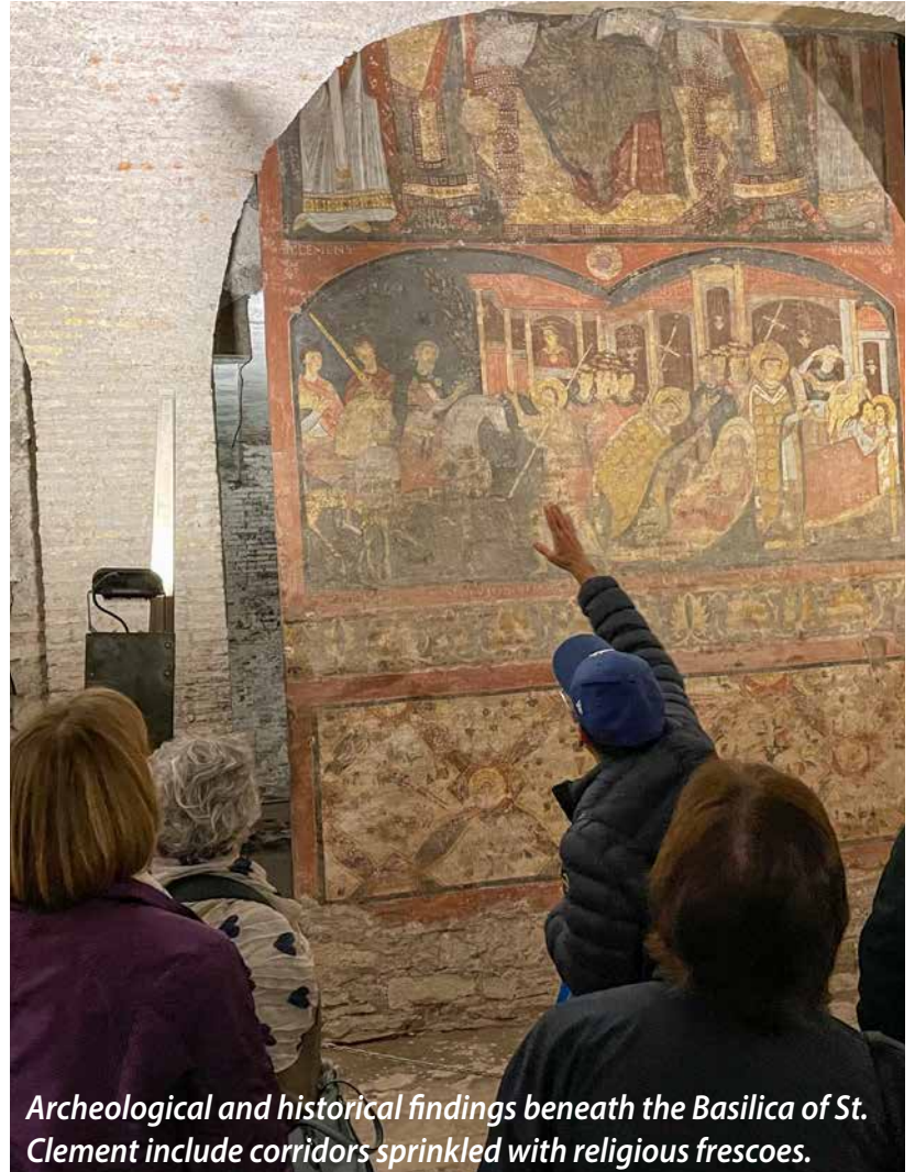
Archeological and historical findings beneath the Basilica of St. Clement include corridors sprinkled with religious frescoes.